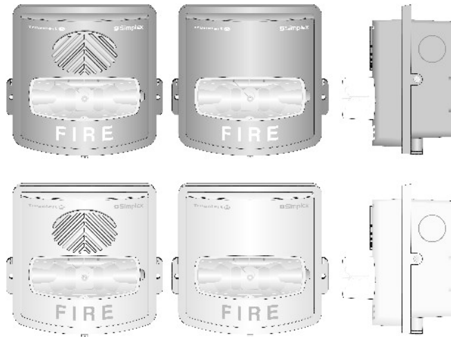
Figure 1: Weatherproof A/V (top) and Strobe (bottom), side view of A/V on Weatherproof Mounting Boxes (right)

TrueAlert ES weatherproof addressable appliances provide visible and audible/visible notification for indoor and outdoor, extended temperature and extended humidity applications. They are individually addressed and receive power, supervision, and control signals from a Simplex fire alarm control unit providing IDNAC Signaling Line Circuits (SLCs).