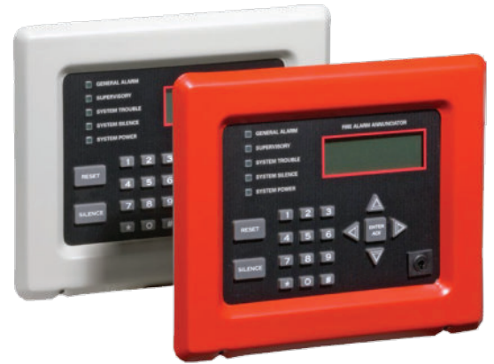
TR-RD1G / TR-RD1R